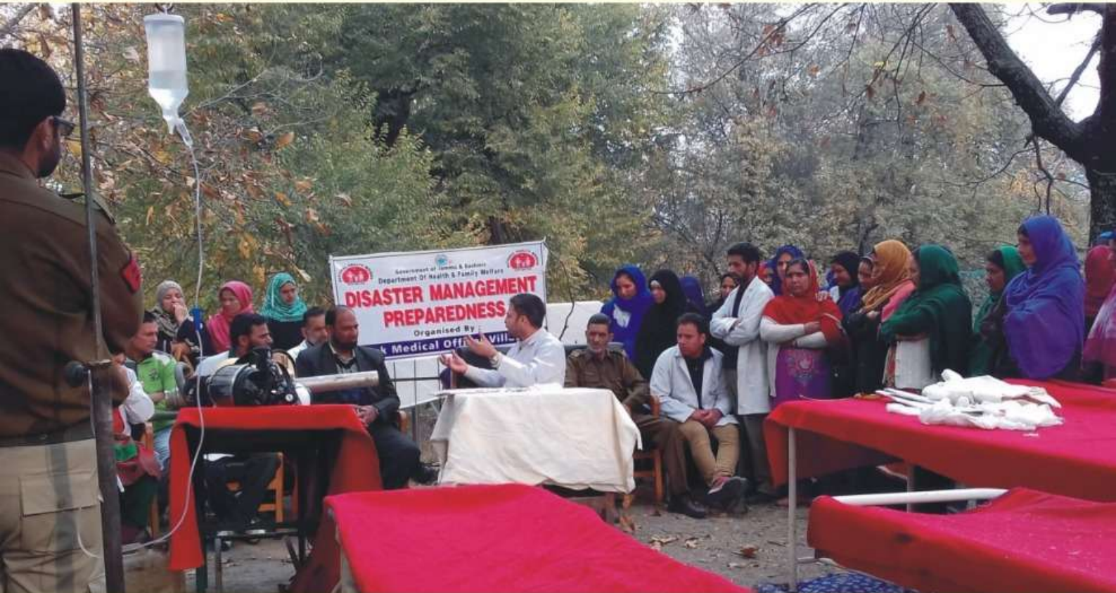
"1st November being observed as Disaster Preparedness Day by Directorate of Health Services, Kashmir"