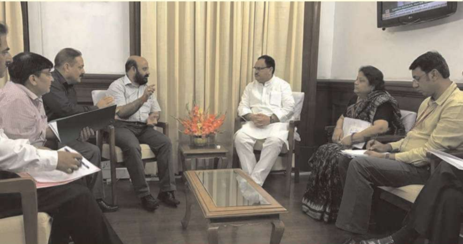
"Meeting of Hon'ble Union Minister of Health and Family welfare Shri J. P. Nadda with Hon'ble Minister for Health & Medical Education, J&K, Shri Bali Bhagat"