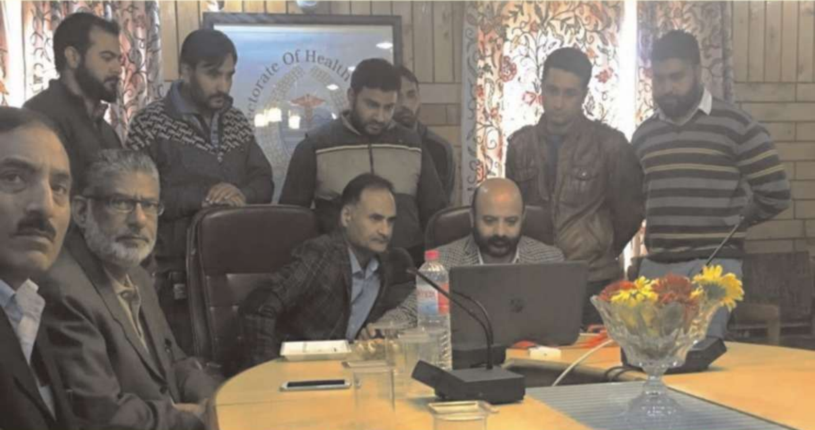
"Launch of Website of Directorate of Health Services Kashmir ( www.dhskashmir.org ) by Hon'ble Minister For Health & Medical Education Shri Bali Bhagat"