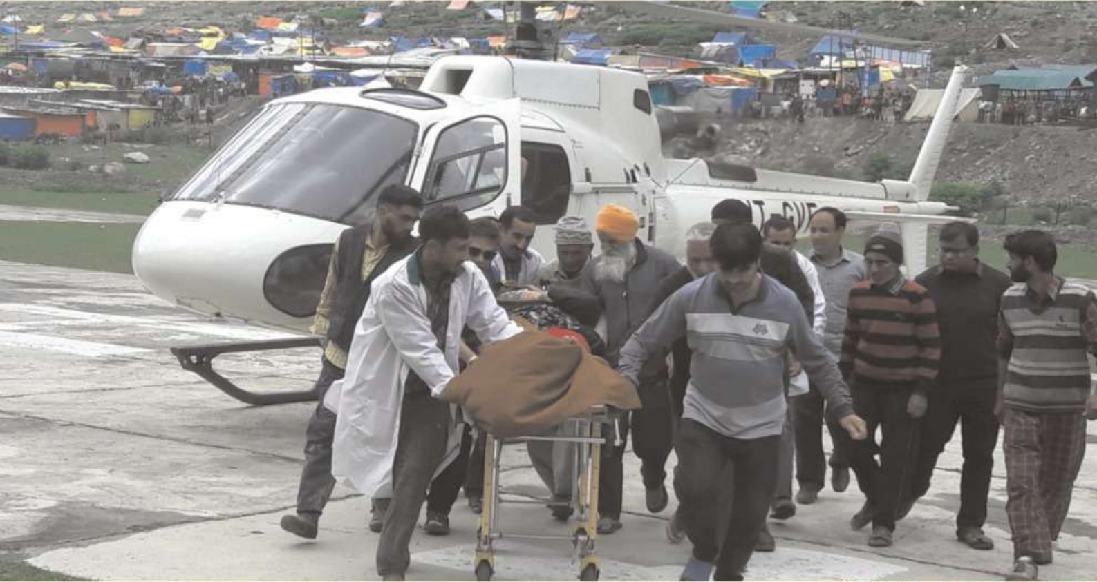
"Emergency Medical services enroute Shri Amarnath Ji Yatra"