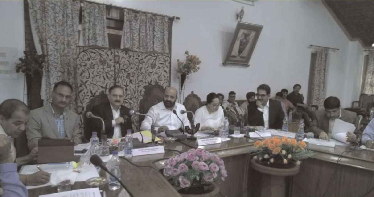
"Annual Review Meeting 2017 Chaired By Hon'ble Minister For Health & Medical Education Shri Bali Bhagat"