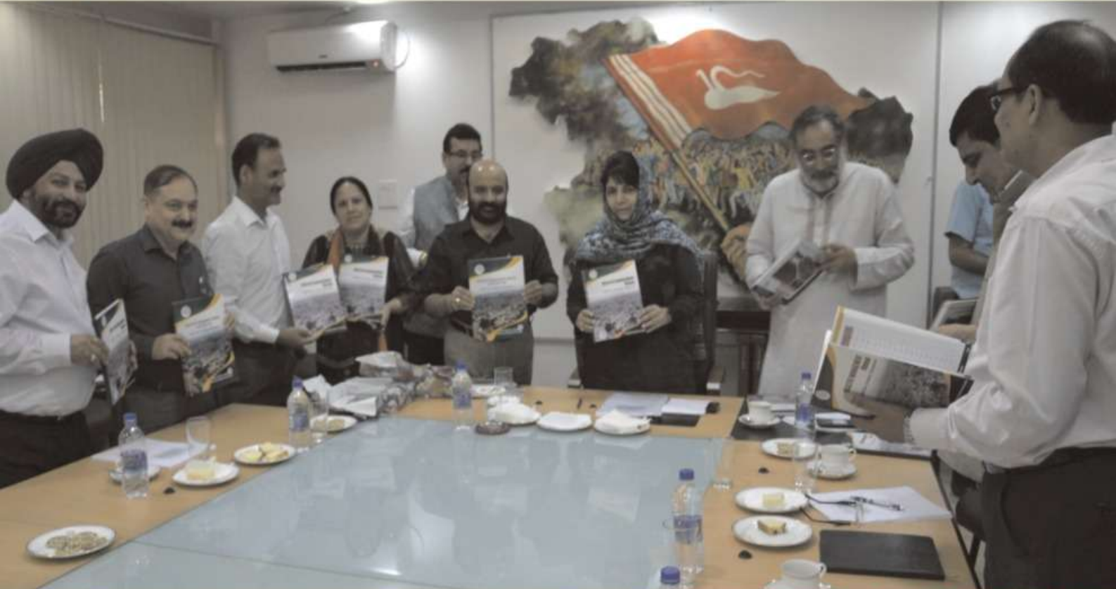
"Inauguration of Disaster Management Manual by Hon'ble Chief Minister J&K Ms. Mehbooba Mufti"