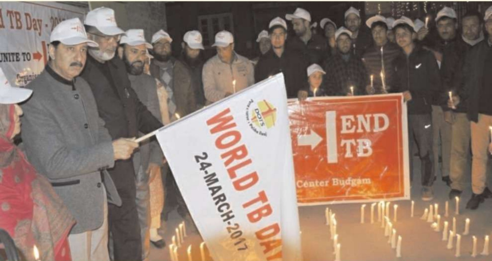
"Celebration of World TB Day. Unite to end TB. Leave no one behind."