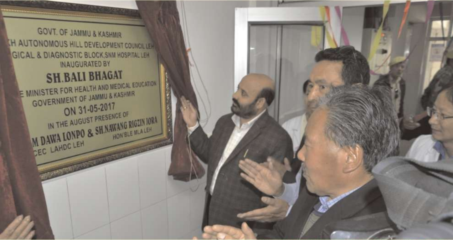
"Inauguration of Surgical & Diagnostic Block SNM Hospital Leh by Hon'ble Minister for Health & Medical Education, Shri Bali Bhagat"