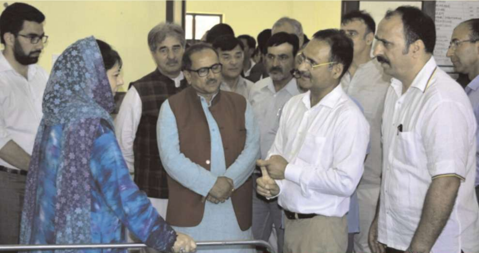
"Visit of Hon'ble Chief Minister J&K Ms. Mehbooba Mufti & Deputy Chief Minister Dr. Nirmal Kumar Singh to District Hospital Anantnag"